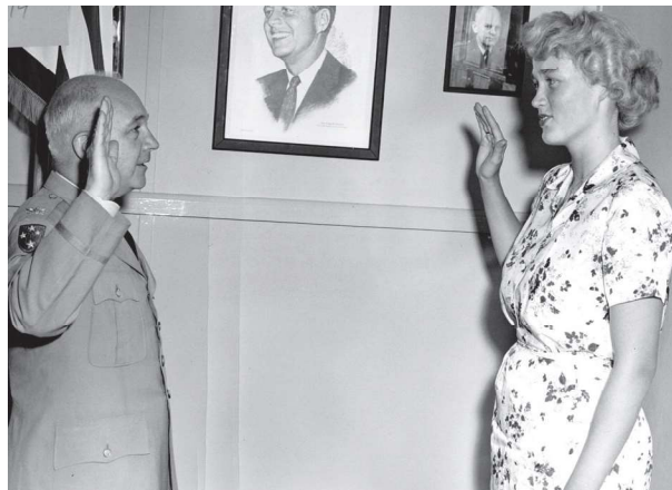
Sworn in as a Women’s Army Corps recruit in 1961. Margarethe Cammermeyer